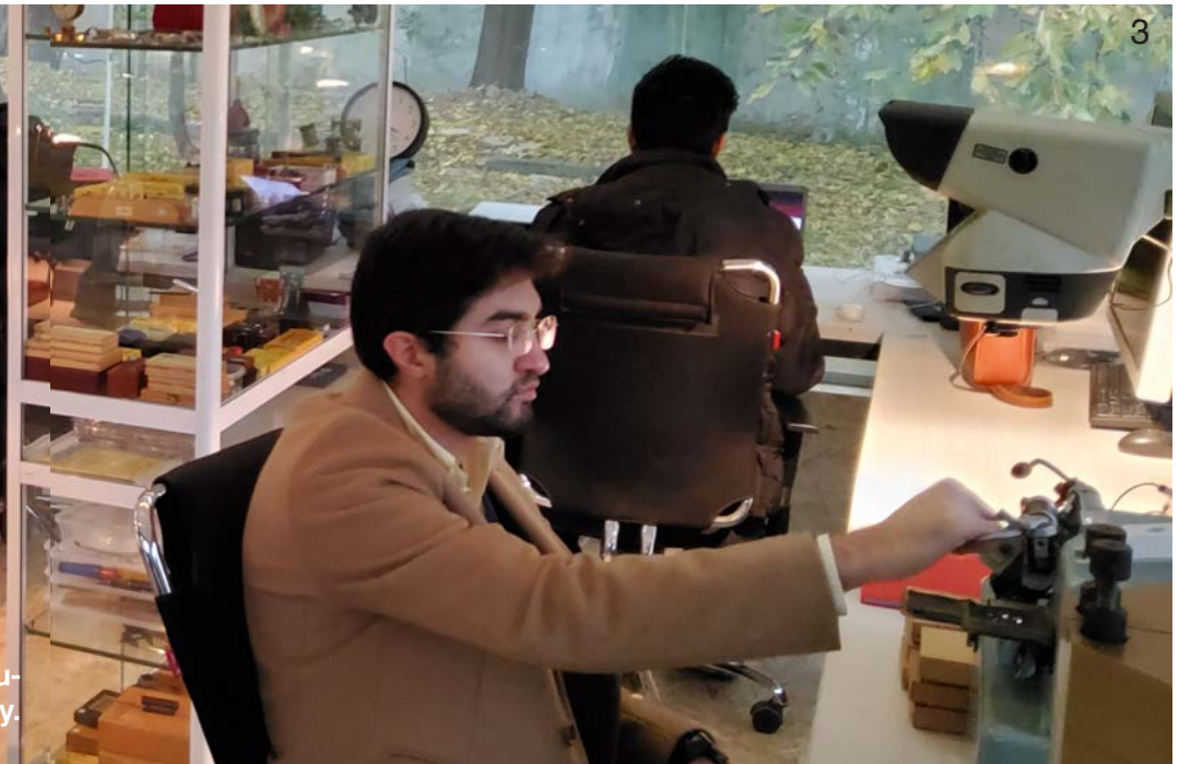
Assembly and Testing is performed under a microscope. All our assembly routine is done under a microscope to assure high reliability of watch assembly.